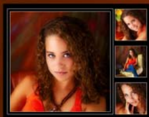
Art Series - D