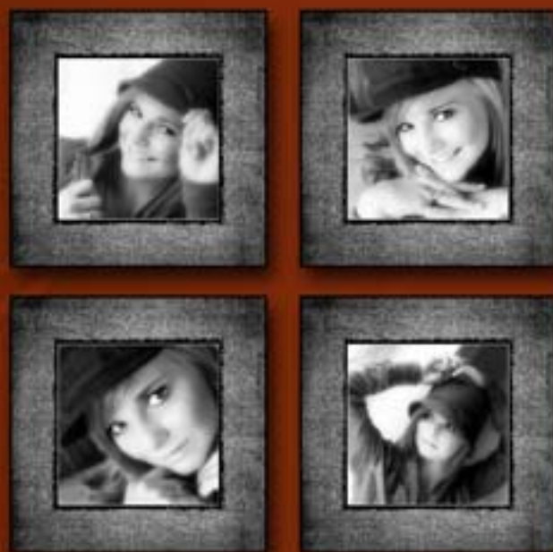
4 - 8x8 Designer