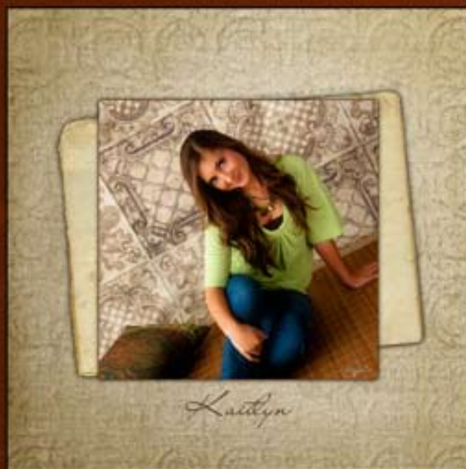
1 - 30x30 Designer

Diane Spagnuolo Photography presents The Designer Series, a collection of elegant gallery wraps. The Designer Series can be hung in your home as a single piece, or as a collection of three or four images. Choose from several different design layouts that our artist will customize to compliment your images. The Designer Series is available in one, three or four pieces for the same investment.