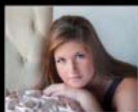
Art Strip E (horizontal) 18 x 6 (3 images)