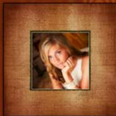
3 - 14x14 Designer