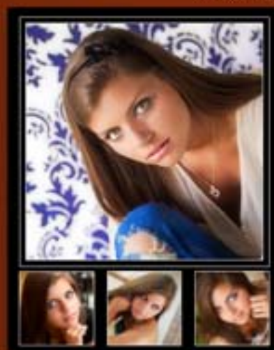
Art Series - E