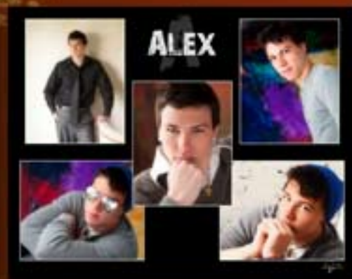
Art Series - B