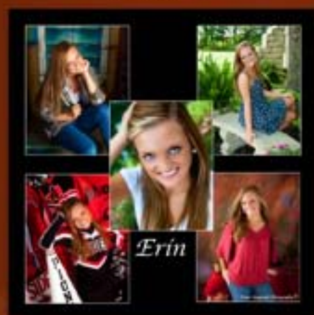
Art Series - G

The Art Series are best made with the correct format photographs (vertical, horizontal or square). However, some of the images may be adjusted to fit the layout. This will be done at the discretion of the artist.