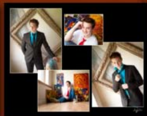
Art Series - C