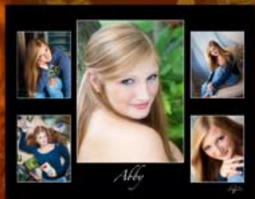
Art Series - A