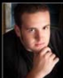
Art Strip E (vertical) 6 x 18 (3 images)