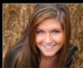
Art Strip D 16 x 6 (3 images)