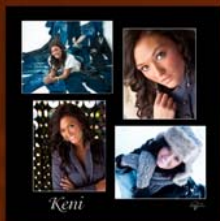
Art Series - F